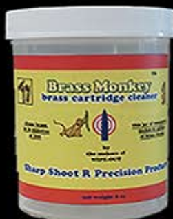
8 ounce jar