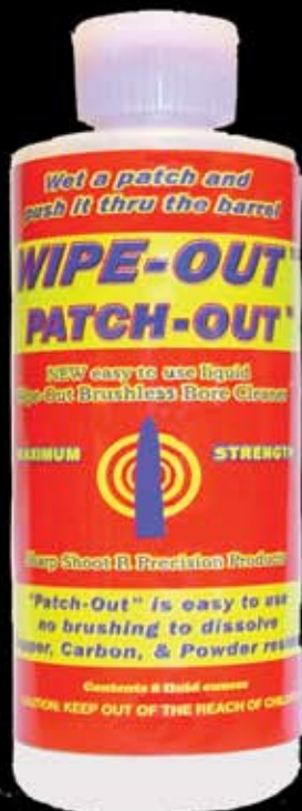
8 ounce bottle

Now available in a convenient flip top bottle