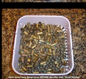
dirty 9 mm range brass