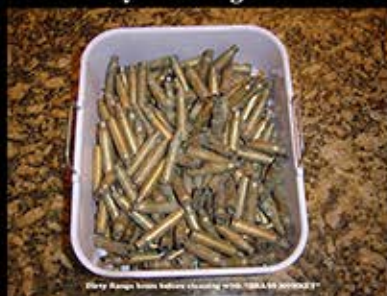
dirty 223 range brass