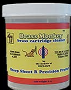
8 ounce jar