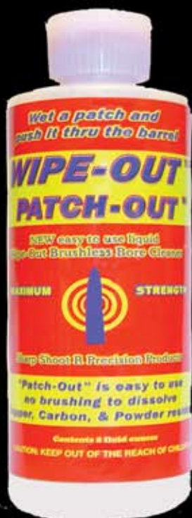
8 ounce bottle

Now available in a convenient flip top bottle