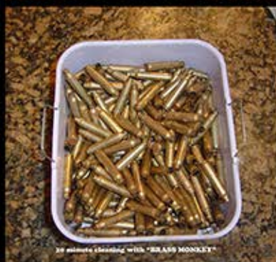
clean 223 brass