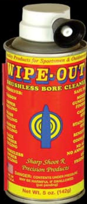
6 ounce can

PUT WIPE-OUT IN A GUN YOU THINK IS CLEAN !